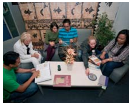
Theology students in the school's reception area, which is always warm and welcoming.

For further information about General Education see www.auckland.ac.nz/generaleducation