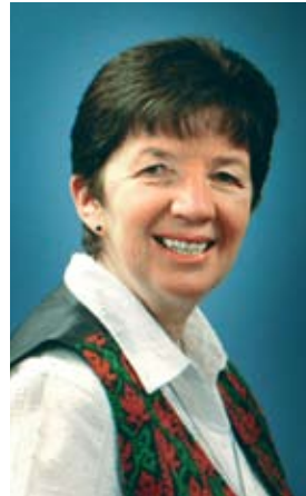
PROFESSOR ELAINE M WAINWRIGHT

You will study with our highly qualified academic staff. View our profiles online at www.theology.auckland.ac.nz