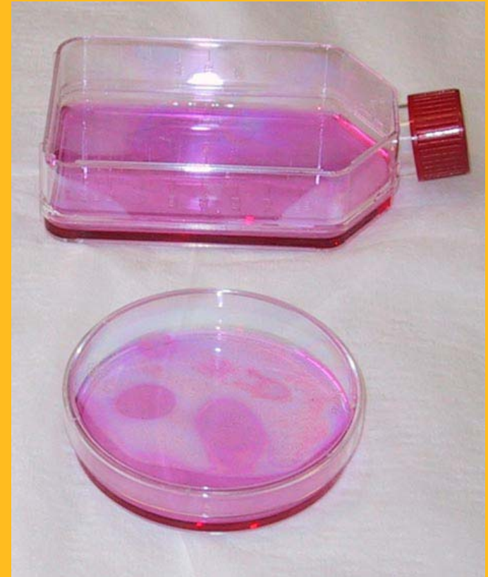
Culture vessels and medium for animal cell culture