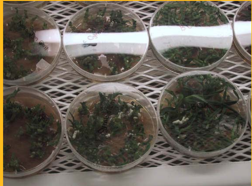
Young cymbidium orchids